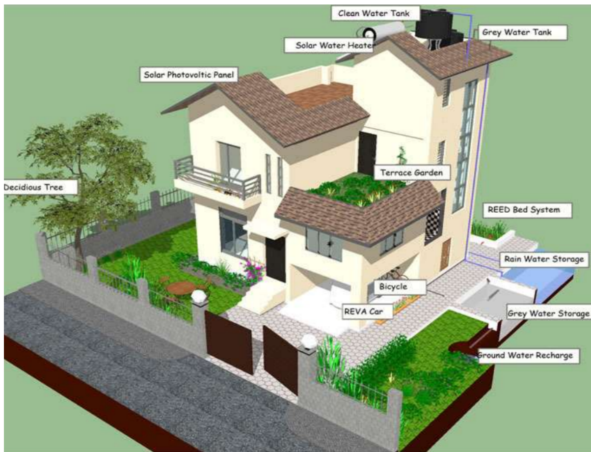
Figure 2.1: The Proposed Green Building