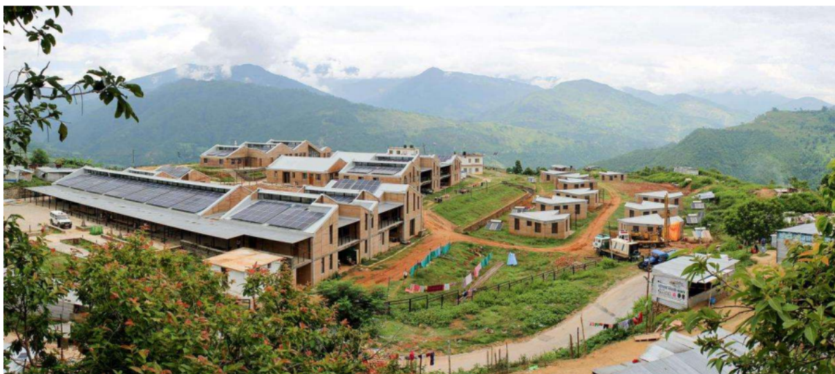
Figure 4.1: Bayalpata Hospital in Accham with rammed Earth Technology

Energy efficiency is a vital component in building eco-friendly constructions. Consequently, less energy is needed to complete the same task. For instance, a compact bright bulb needs a lot